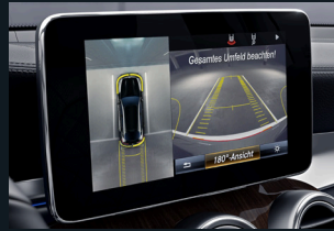
Surround view system