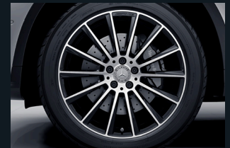
20-inch AMG Multi-spoke wheels