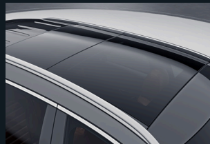
Electric sliding sunroof