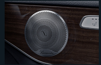
Burmester® surround sound system