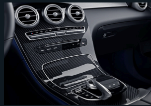
AMG carbon-fibre light longitudinal-grain aluminium trim