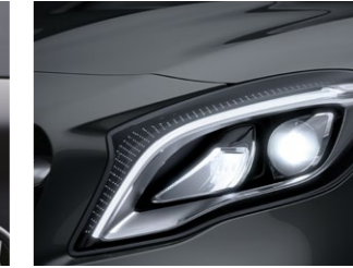
DYNAMIC SELECT (4 drive programs)