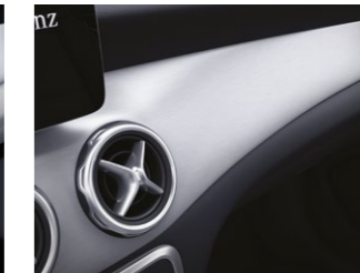
Light aluminium trim with longitudinal-grain 2