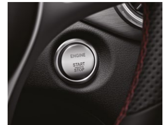
KEYLESS-GO Start Function