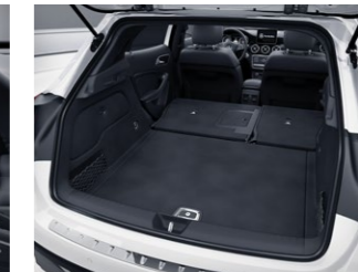
Load Compartment package