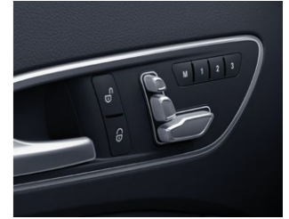
Front seats electrically adjustable with memory function