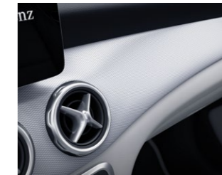
Aluminium trim with trapeze cut 1